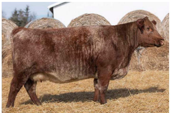
PVF BEAUTY QUEEN 45A, dam of Lot 45