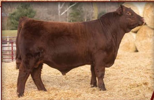
PVF RELENTLESS 37K, Herdsire at Gilman Shorthorns